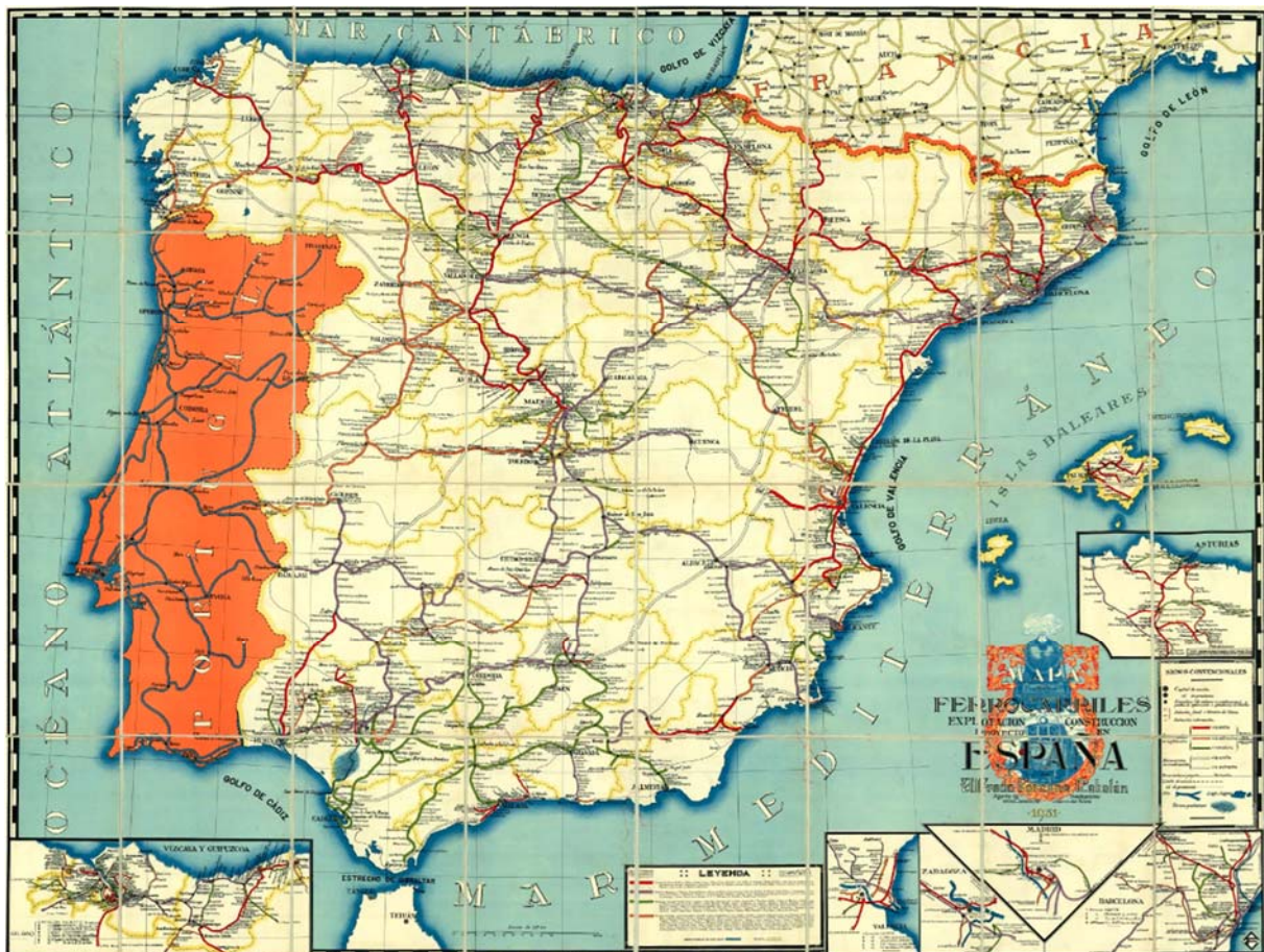
Figure 3. Railway network, Spain, 1931

The geolocation of stations and stops was mainly carried out by Sergio Barbosa. In doing so, we design a straightforward method based on the extraction of all the stations and stops available in a detailed 1931 map of the Spanish railway network including wide and narrow gauges (Figure 3). Afterwards, the station names were checked in Ferropedia, Wikipedia, and general bibliography on the railway extension in Spain to extract the location, province, and opening date, when available. The stations and stops were geolocated using, mainly, Google Maps and Geohack.